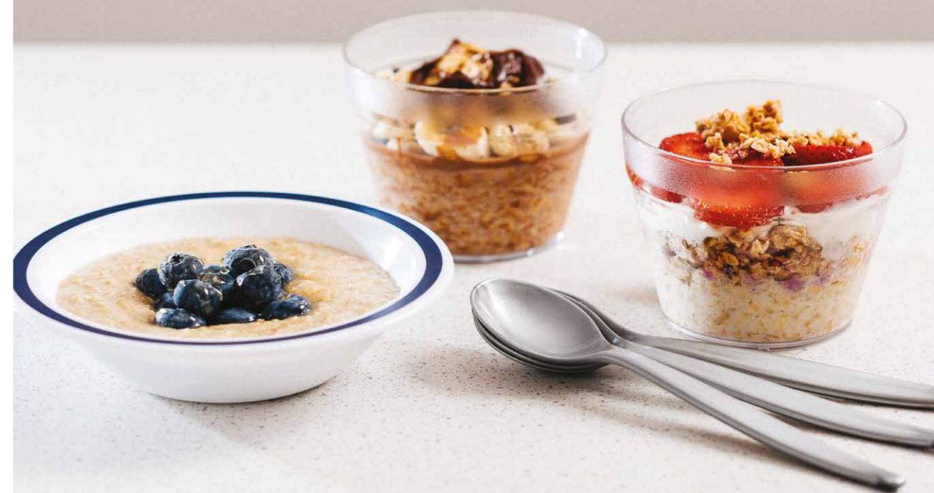
OATS & MORE: Banana & Chocolate and Strawberry & Granola Overnight Oats. Cinnamon Porridge with Blueberries

026RBL 17.3cm Royal Blue Duo Bowl, 080CLE Clear MultiPots, 517CSI Silver Copolyester Dessert Spoons.