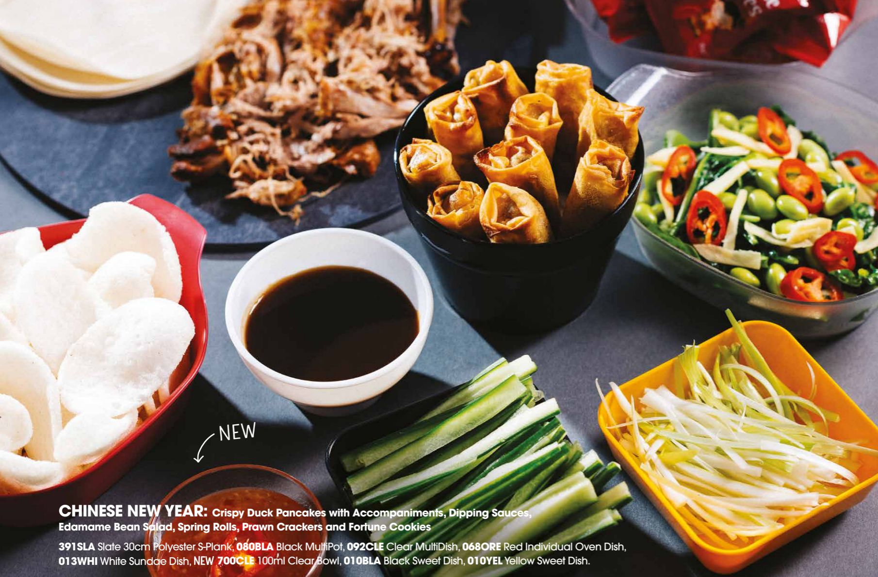
CHINESE NEW YEAR: Crispy Duck Pancakes with Accompaniments, Dipping Sauces, Edamame Bean Salad, Spring Rolls, Prawn Crackers and Fortune Cookies 391SLA Slate 30cm Polyester S-Plank, 080BLA Black MultiPot, 092CLE Clear MultiDish, 068ORE Red Individual Oven Dish, 013WHI White Sundae Dish, NEW 700CLE 100ml Clear Bowl, 010BLA Black Sweet Dish, 010YEL Yellow Sweet Dish.