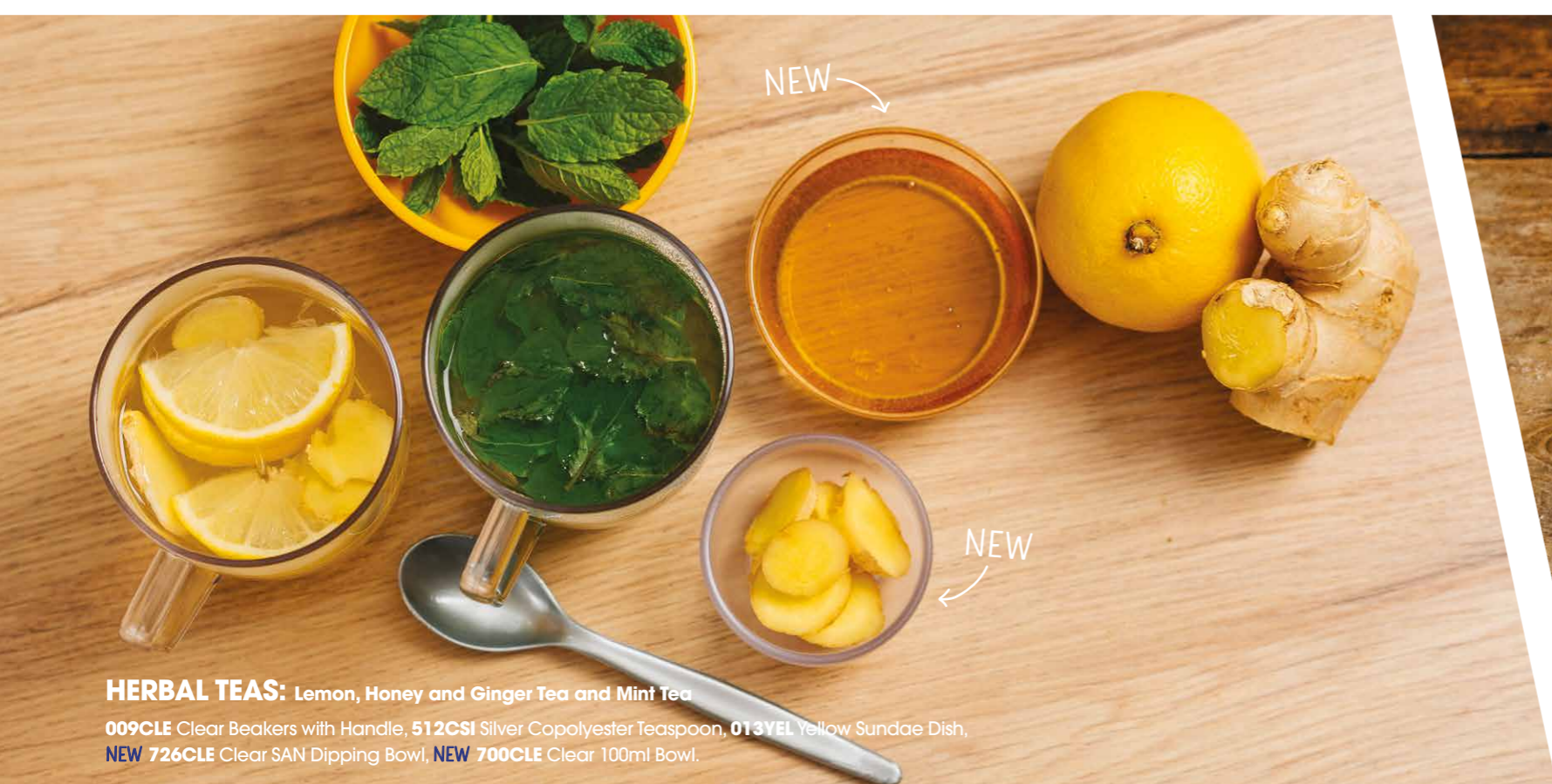
HERBAL TEAS: Lemon, Honey and Ginger Tea and Mint Tea 009CLE Clear Beakers with Handle, 512CSI Silver Copolyester Teaspoon, 013YEL Yellow Sundae Dish, NEW 726CLE Clear SAN Dipping Bowl, NEW 700CLE Clear 100ml Bowl.

026RBL 17.3cm Royal Blue Duo Bowl, 080CLE Clear MultiPots, 517CSI Silver Copolyester Dessert Spoons.