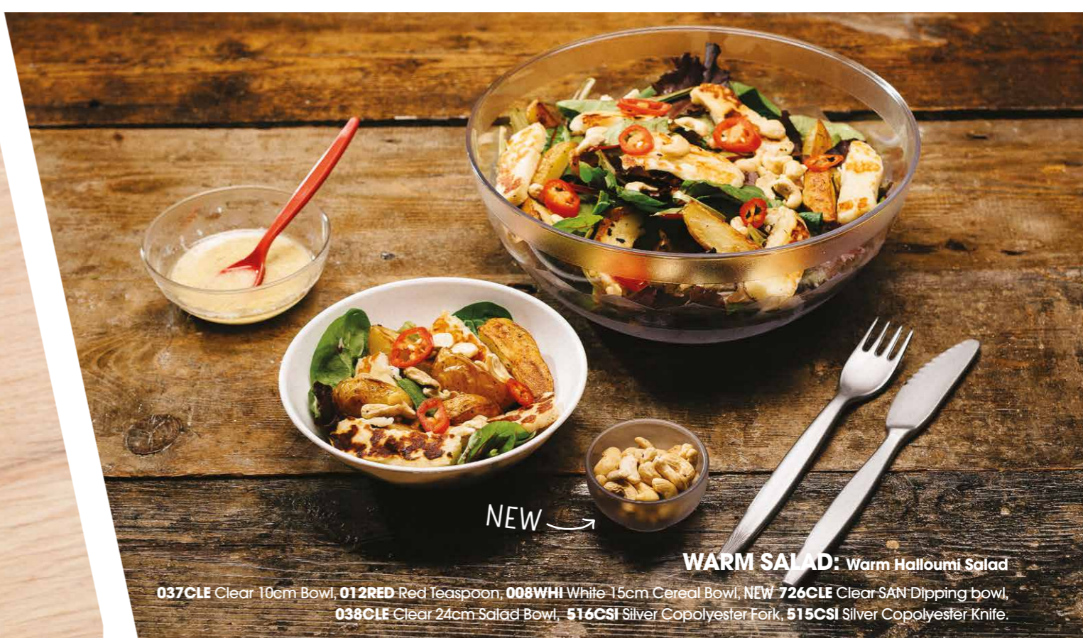
WARM SALAD: Warm Halloumi Salad

037CLE Clear 10cm Bowl, 012RED Red Teaspoon, 008WHI White 15cm Cereal Bowl, NEW 726CLE Clear SAN Dipping bowl, 038CLE Clear 24cm Salad Bowl, 516CSI Silver Copolyester Fork, 515CSI Silver Copolyester Knife.